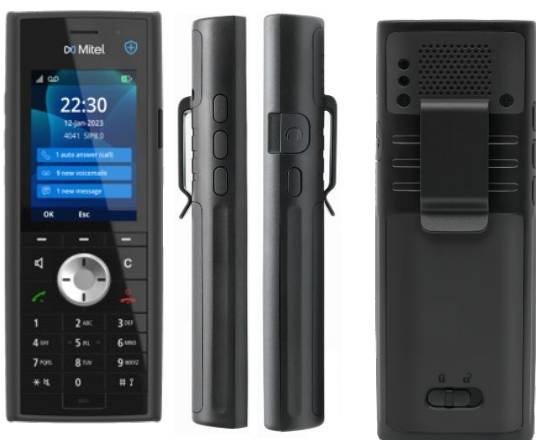
*Mitel 722dt DECT handset

By definition, the function and firmware updates keep the handsets up-to-date over-the-air. The new 700d DECT series will work together with the existing 600d DECT handsets and Mitel SIP DECT base stations, as they have the same RFPs. Utilize your existing investment in Mitel infrastructure - no need to rip and replace.